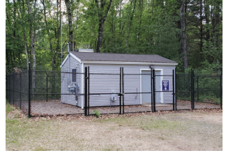
Well # 4 Renovation Project