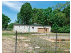
East Street Water Treatment Plant