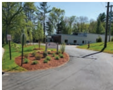
Sudbury Water District Administration Building 199 Raymond Road