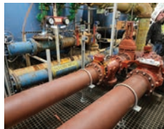
New inside piping for future PFAS Mitigation at the Raymond Road Water Treatment Plant