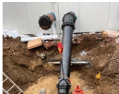
New outside piping for future PFAS Mitigation at the Raymond Road Water Treatment Plant